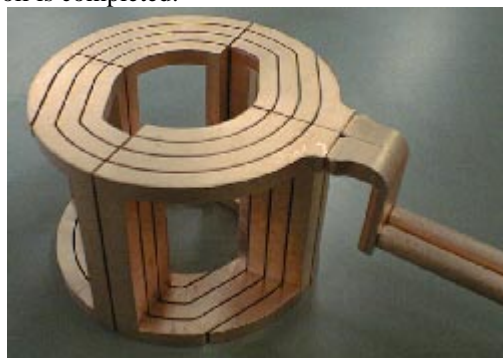
Figure 2: "Sakae coil".

The manufacturing process of the coil is described roughly as follow [3]. First, grooves and through holes is formed into a cylindrical oxygen-free copper block. Secondly, the grooves and through holes are filled with wax. Thirdly, the surface of the wax is coated with silver powder to give electrical conductivity. After that, the surface coated with silver powder is PR electroformed building up a lid of the grooves. Then, hollow structure is obtained when the wax is removed by heating. Finally, the holes in which magnetic poles are inserted are formed by cutting out unnecessary parts of the block, and then the coil is completed.