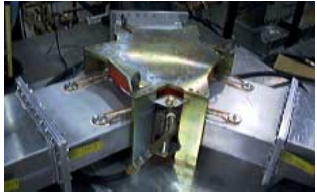
Figure 2: AFT 700 MHz APT Circulator Installed on the Test Stand.

the waveguide and matching posts in order to increase coolant flow to the ferrite plates. Results from these efforts were positive but the circulator continued to arc at power levels of 500 kW.