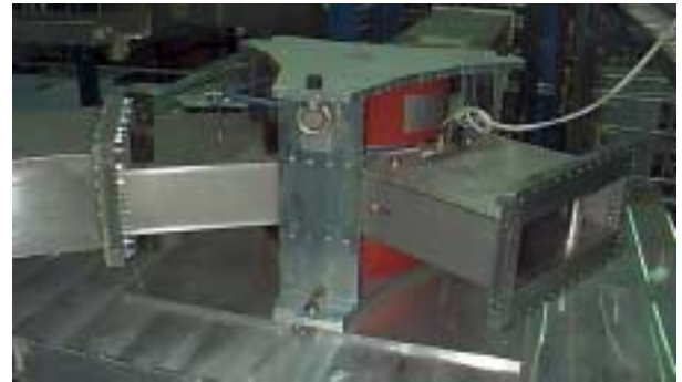
Figure 1: AFT 350 MHz APT Circulator.

The APT 350 and 700 MHz klystrons require circulators that are capable of operating indefinitely with up to full reflection at any phase. The circulators were specified to function properly under these conditions at power levels up to the maximum CW forward power out of each klystron: 1.2 MW for the 350 MHz klystron and 1 MW for the 700 MHz klystron. A 350 MHz circulator was easily produced as 352 MHz circulators at these power levels are already in use. The APT 350 MHz, 1.2 MW circulator produced by Advanced Ferrite Technology, Inc. (AFT) is shown in Figure 1.