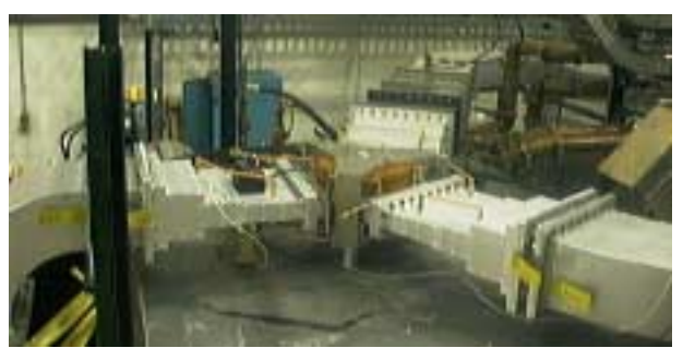
Figure 4: Atlantic Microwave 700 MHz 100 kW Circulator Installed on the Test Stand.

steady-state temperature at each 50 kW step. The circulator began to arc when the power reached 600 kW. The circulator was then tested with the sliding short adjusted to produce an H-field maximum in the center of the circulator and with the RF power level increased in 50 kW steps as before. Under these conditions, the circulator power reached only 300 kW before the circulator isolation degraded to the point that further increases in power were not possible. Improvements to the isolation can be made by using a TCU to compensate for temperature effects in the ferrite. The 100 kW circulator prototype did not include a TCU, but the design of the full-scale 1.0 MW circulator will include a TCU.