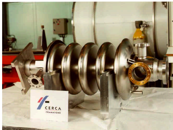
Figure 1 Bare niobium 5-cell cavity

The APT 5-cell cavities consist of the bare cavities made of niobium (RRR=250), and the inner and outer helium vessels made of unalloyed titanium [4]. A completed bare cavity is shown in Fig. 1. These bare cavities were fabricated by CERCA in France. The half-cells were formed by spinning, and they were electron-beam welded to form bare cavities. The fabricated bare cavities are RF-tested before they are sent to Titanium Fabrication Corporation for installation of an inner helium vessel by an electron-beam-welding process. To date, inner helium vessels have been installed on two of the four cavities (Fig. 2). Following inner-helium-vessel installation, the cavities will be RF tested again to insure that cavity performance has not been degraded during the inner-helium-vessel installation. After the required performance is confirmed, outer helium vessels, instrumentation, and tuners will be installed to complete the cavities for integration into the cryomodule.