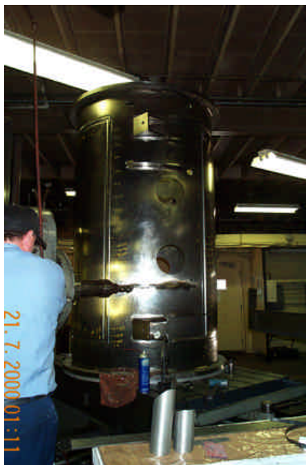
Figure 6 Milling the o-ring groove on the cryostat

respectively, 10 and 30 watts. This performance is as predicted by our thermal model.