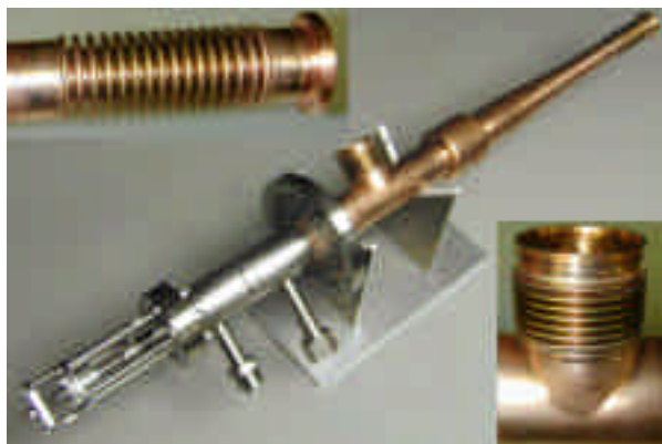
Figure 5 Adjustable inner conductor

After high-power operations of the adjustable couplers, we observed failures of the tip bellows and electron etching. Two tip bellows failed after reaching 750 kW. Preliminary inspection indicated that the failures were caused by excess temperature at the tip bellows, which agreed with temperatures as calculated in thermal simulations. Thermal simulations also showed that the temperature of the tip-bellows could be effectively reduced by 400°C by copper plating the BeCu bellows and cooling using gaseous helium (instead of air) as in the cryomodule design. The electron etching is marks on the inner conductors that look like electron tracks. The density of the etching and the depths of the marks increase with RF power levels.