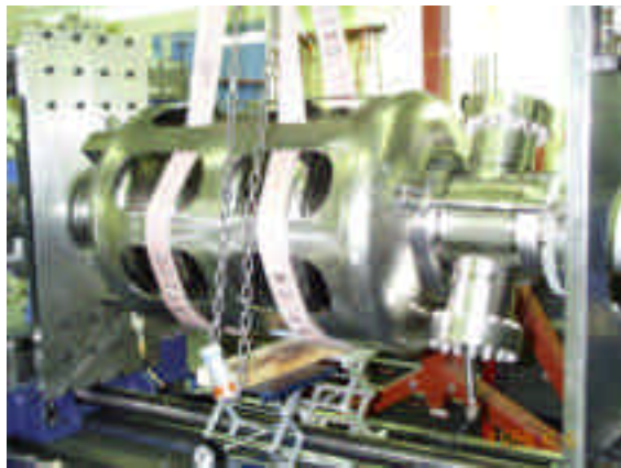
Figure 2 Cavity with inner helium vessel installed

high-pressure water rinsing; and 3) cavity baking at 150°C.