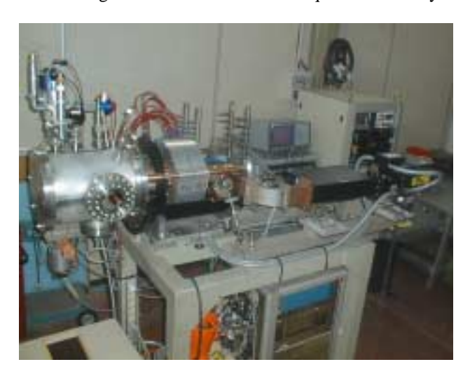
Fig 3: General view of the source test stand

Figure 3 shows a general view of the source test stand. The first plasma has been produced for few weeks and any negative hydrogen ion beam has been observed since then. Copper (from plasma chamber body) and carbon pollution due to O-ring attack by the RF has been seen, it is probably the main reason of the hydrogen negative ion destruction. Improvements to avoid this RF attack are in progress. However, the electron separator and the magnetic filter behavior seems quite satisfactory.