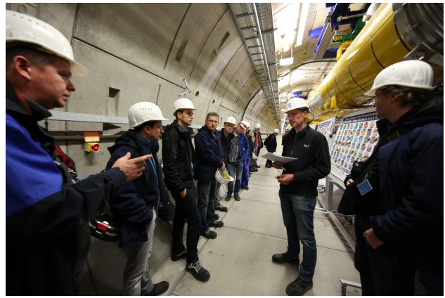
Figure 3: Weekly meeting in the accelerator tunnel at the site of installation

In contrast to other approaches it was assumed that the process could be speeded up permanently because of the growth of experience in the interaction of the WPs. So in the on-going installation each opportunity was caught which allowed to start a process step earlier than originally planned. In addition, the initial plan # 1 was optimized three times, from one cryo-string installation to the next.