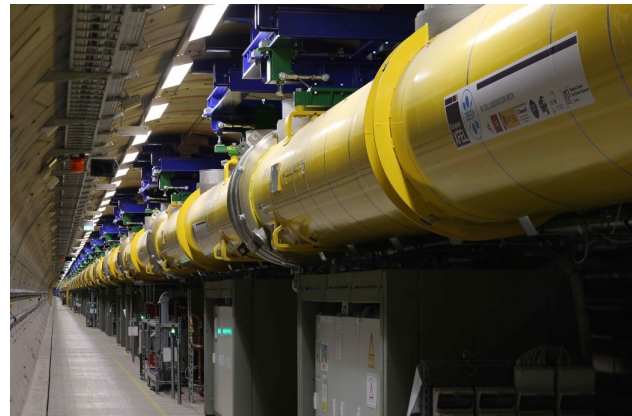
Figure 1: Completed main accelerator in one single tunnel. On top accelerator modules and cable trays. Below RF stations, electronic racks, power and water supply etc.

At the beginning of 2015, the interaction between these WPs was not ideal. For this reason, the installation speed was not sufficient to ensure the completion in 2016. So a new installation management approach was introduced in mid 2015.