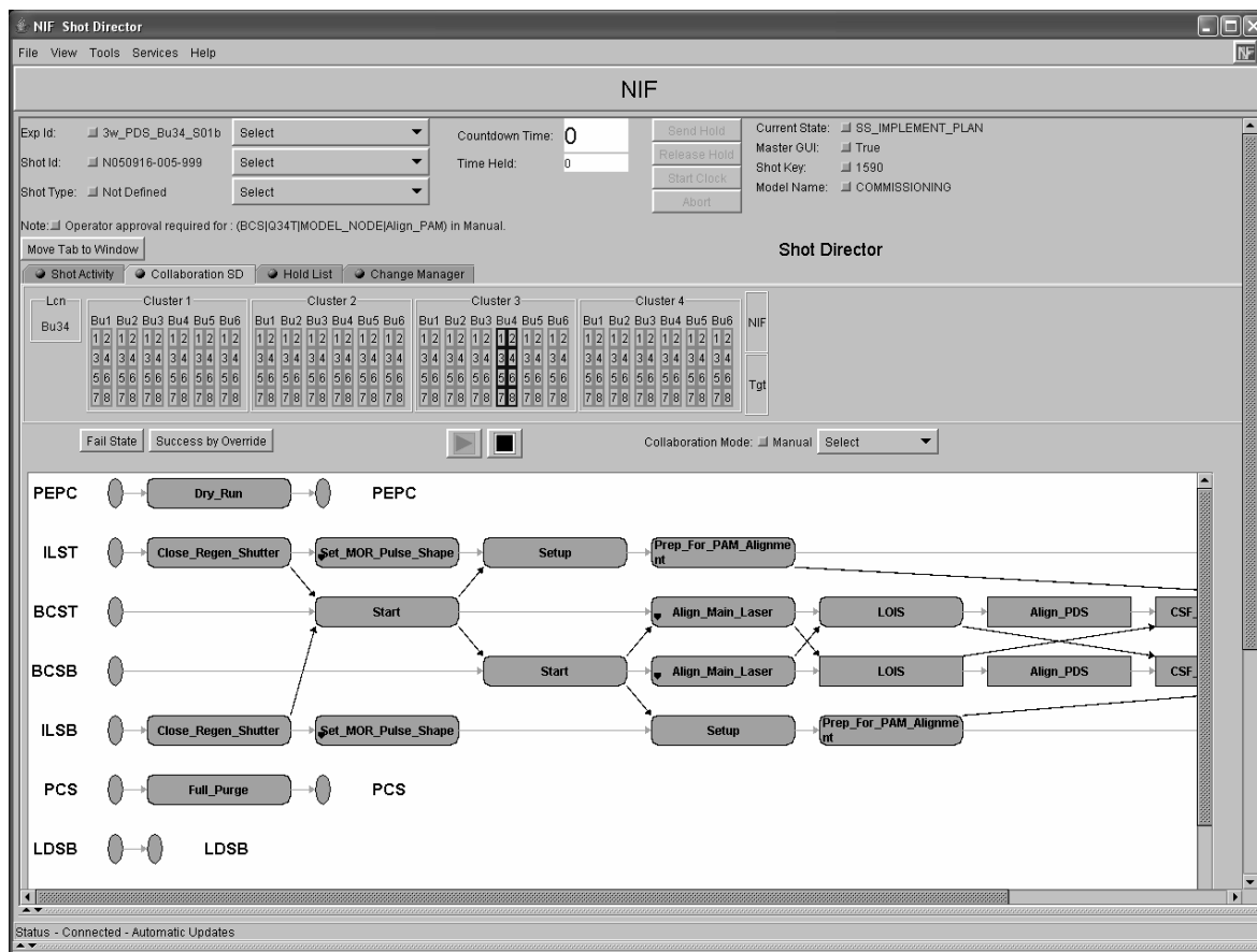
Figure 3: Shot Model workflow

The Subsystem Shot Management Layer is composed of a collection of Shot Supervisor applications, each accepting commands and reporting status to a specific Collaboration Supervisor. These Shot Supervisors represent specific NIF subsystems. One example is the Beam Control System. The Beam Control System (BCS) is responsible for controlling the pointing of the laser beam through the main laser system to the center of the target chamber. In general, FEPs, subsystem status/control supervisors, and their GUIs support manual operator interactions with hardware. A Beam Control Shot Supervisor for each quad (top and bottom) reports to the Collaboration Supervisor and automates the BCS shot activities by executing Macro Steps that manipulate bundle BCS devices. Macro Steps are transient software objects. The Subsystem Shot Management Layer creates a specific Macro Step object upon receiving an execute command from the Collaboration Supervisor, which is discarded upon Macro Step completion.