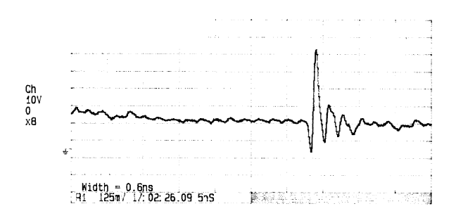
Fig.1: Single beam pulse in the 25 MHz train at the output of the 3 GHz pre-buncher.

The current amplitude was stable within 10% of its maximum in the train of pulses. At 30 MeV the energy spread was measured to be better than \pm 0.51% in good agreement with the previous measurements [5]. Due to the short time available for the FEL measurements it was not possible to completely optimize the beam parameters. The method of the three quadrupoles has been used [5]. We are confident that improvements can be achieved in the beam quality parameters with a more careful optimization in the Linac.