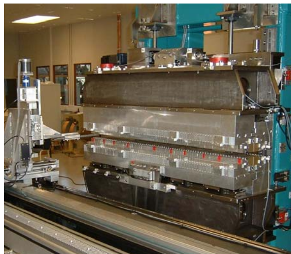
Figure 3: The last insertion device to be installed in the SRS, in 2004, shown on test; it is an Apple-II-style undulator, which replaced U5.