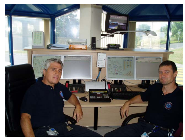
Figure 1: CSAM HCI consoles in the SCR.

alarms directly from the HCI which was not possible with the previous alarm monitoring system.