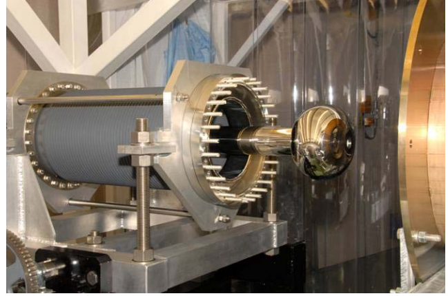
Figure 2: ERLP gun ceramic and cathode ball.

Procurement of the large ceramic required to support the cathode ball at 350 kV proved to be the most difficult issue that the project has had to deal with up to this point. A novel single-piece design was chosen, utilising a ceramic with a bulk resistivity (the original TJNAL used a coated two-piece design). Problems with the processing of this component, mainly due to its size, significantly delayed its delivery. However, a fully-compliant part has been at the laboratory now for several months and has been installed in the completed gun. Fig. 2 shows the ceramic supporting the highly-polished cathode ball.