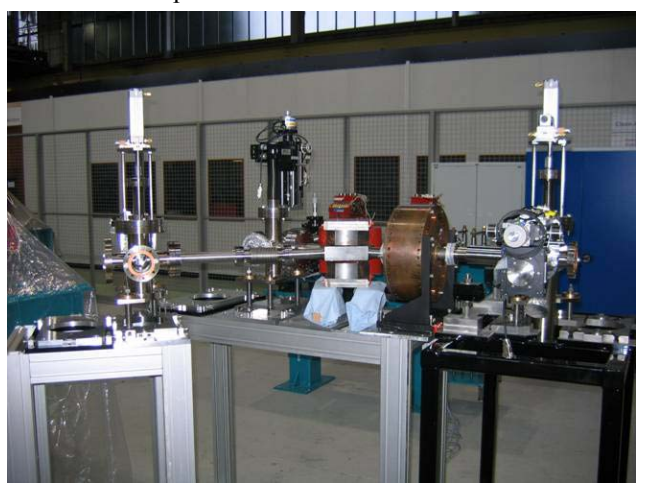
Figure 4: Gun diagnostic beamline prior to installation

An important element of the diagnostic beamline that is shared with the completed machine is the buncher. The electron bunches produced by the GaAs cathode will have quite a long tail due to the nature of the electron emission process. The purpose of the buncher is to reduce the longitudinal emittance before the bunch enters the booster. In the short term the buncher will be powered by one of the IOT devices under development as the RF power source for the superconducting linac modules. This will be replaced before final machine commissioning with a solid-state amplifier.