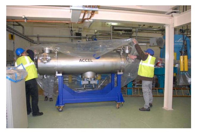
Figure 3: The first superconducting linac module arriving in the accelerator hall.

In order to characterise the gun as fully as possible before injection of electrons into the superconducting linac modules and to verify the results of simulation work, a dedicated gun diagnostic beamline has been designed, manufactured and installed [4]. This will be ready for the date when the first electrons are expected from the gun in August. Fig. 4 shows the gun diagnostic beamline prior to installation.