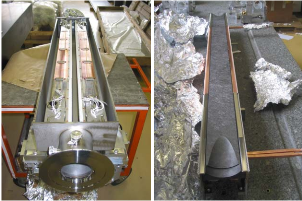
Figure 2: Pictures of the prototype for a secondary CC collimator TCSG. Left: Tank installed with two jaws. Right: View of 1.2 m long CC jaw with RF tapering.

The design and prototyping of a secondary graphite collimator was started in Sep. 2003. The mechanical design and prototyping is described in detail in [16]. Pictures of the first prototype collimator are shown in Figure 2.