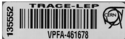
Figure 1: Barcode sticker

Every piece of equipment, which comes out of the LEP tunnel, is attributed a unique "Trace-LEP" number. This number is represented as a barcode on a sticker, which is stuck on the equipment (see Fig. 1). For bulk material, the barcode sticker will be glued on the container. A member of the Traceability Team (a Tracer ) must identify the container's contents on the fly.