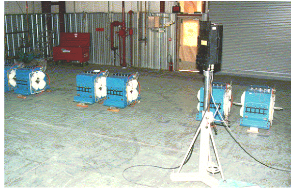
Figure 3 Six magnets ganged for fiducialization

magnet center by the average of magnet end positions, and remaining coordinate axis orientation by a best-fit plane through lamination edge coordinates.