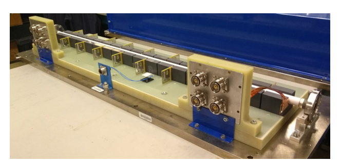
Figure 2: Kicker magnet with cover and top busbar removed.

To achieve the required integrated field, three 1 m long kicker magnets, each providing 4 mT-m, are pulsed simultaneously. Each kicker section is composed of 18 gapped ferrite blocks arranged to enclose a ceramic beampipe as shown in Fig. 2.