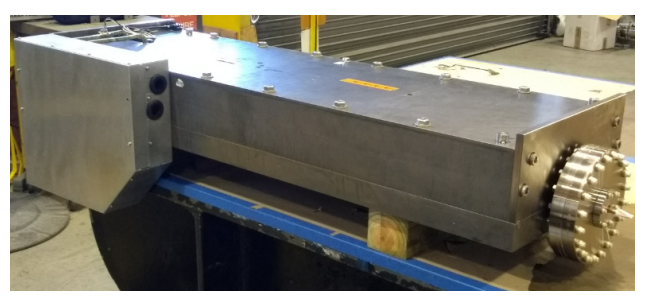
Figure 3: Spreader septum.

The spreader septum is a Lambertson type septum magnet, with a circular profile field free region and a 3" wide pole. Due to the 15 mm maximum separation of the kicked and un-kicked beams leaving little space for a vacuum chamber, the spreader septum requires an in-vacuum pole. The spreader septum has engineering name 0.625SD38.98, having a dipole gap of 0.625" and a core length of 38.98". A picture of the septum is seen in Fig. 3. The design parameters for the 0.625SD38.98, sufficient for up to 10 GeV of the HXR and SXR beams, are given in Table 1.