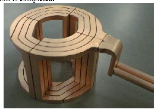
Figure 2: "Sakae coil".

The manufacturing process of the coil is described roughly as follow [3]. First, grooves and through holes is formed into a cylindrical oxygen-free copper block. Secondly, the grooves and through holes are filled with wax. Thirdly, the surface of the wax is coated with silver powder to give electrical conductivity. After that, the surface coated with silver powder is PR electroformed building up a lid of the grooves. Then, hollow structure is obtained when the wax is removed by heating. Finally, the holes in which magnetic poles are inserted are formed by cutting out unnecessary parts of the block, and then the coil is completed.