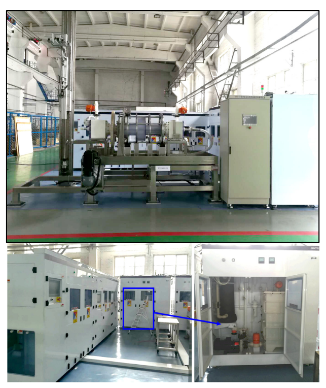
Figure 4: The picture of the EP system integrated at IHEP for water test.