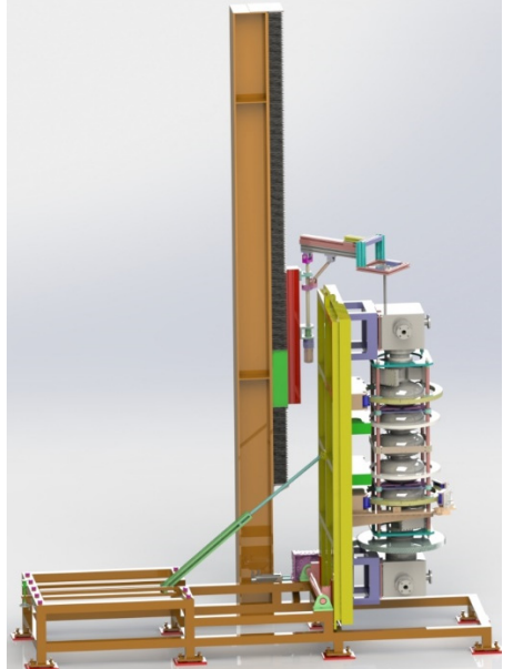
Figure 1: Mechanical rotation and turning platform.

At Last, materials of the platform is SUS304 to avoid the etching and rusting.