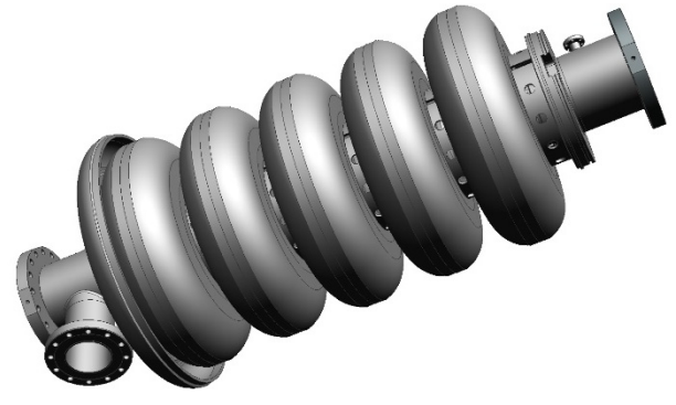
Figure 3: View of the prototype cavity under production.

The two prototypes will help completing the development of surface treatments for the PIP-II goals and will be vertical-test qualified independently at Fermilab and INFN. Its then expected to proceed with jacketing and dressing up of at least one of these cavities so to conclude this prototyping phase with the qualification via horizontal test of a dressed cavity (with power coupler) in STC at Fermilab.