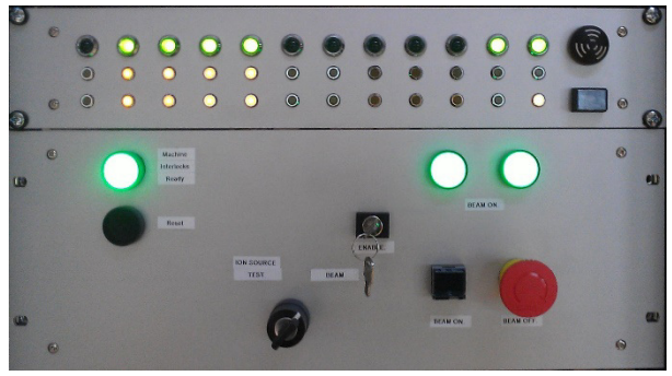
Figure 6: Machine interlock and control status panel.

FETS has numerous separated systems which must be operational and dependant on each-other, in order to prevent damage or a dangerous condition arising.