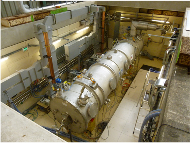
Figure 1: M-ECCTD cryomodule installed in the test station at CEA (with roof removed).

allows monitoring the cryomodule instrumentation and allows making regulations on the helium level and some of the components temperatures. The slow tuners are operated by a PLC and the piezo stacks foreseen for the Lorentz forces detuning compensation are actuated by Noliac power supplies.