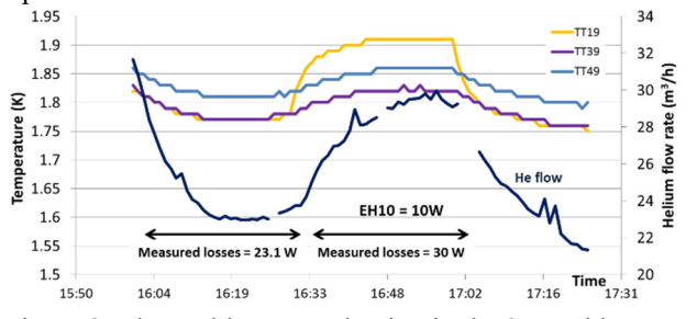
Figure 2: Thermal losses evaluation in the 2 K cold mass.

The heat load evaluation was performed during the last two days of operation, when the liquid helium level was high enough to fill completely the cavity tanks and the diphasic line. The measured liquid helium level is between 90 and 93 % which corresponds to the lower part of the diphasic tube.