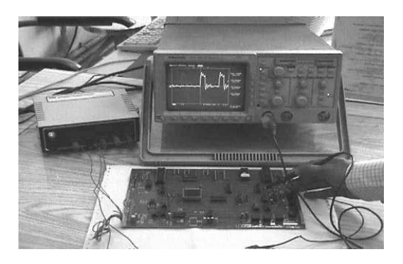
Fig3: Front Panel controller card under testing

Front panel is a user interface. As mentioned earlier, the user can control various parameters of the power supplies, apart from switching it ON/OFF, with the help of buttons provided on the panel. The user can also see the status of various interlocks and other information displayed on LCD and indicated by LEDs. The front panel is built around an 80C196KC microcontroller which is the heart of the hardware circuit. The microcontroller fetches the software instructions one by one from the memory and executes them. The software is an interrupt based program. Any button, for instance ON