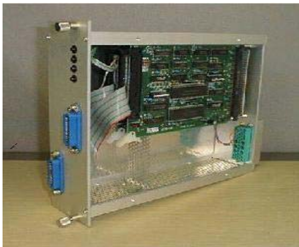
Figure 1. The GAC is assembled into a NIM module.

In controlling and monitoring the accelerator or the experimental physics, the GPIB is one of the useful field buses. When the primary address is used, one GPIB controller can control 30 devices. According to the specifications: (IEEE-488.1), one GPIB controller can control 960 devices when the extended two-byte address function is used. However, there is one inconvenience. There are many useful instruments equipped with GPIBs: oscilloscopes, multi-meters, and accelerator control devices. However, they are scarcely