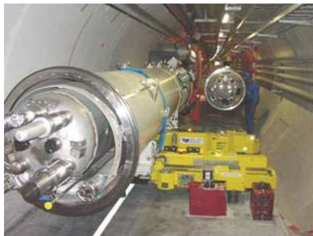
Figure 3: Transfer with TES of a short straight section to the magnet support jacks. In the background a cryo-dipole already in its tunnel position

Two transfer tables, making up a Transfer Equipment Set (TES) can then be positioned under the magnet. The TES can handle the cryo-magnets with 6 degrees of freedom and high precision (0.1 mm). The TES takes over the cryo-magnet from the unloading equipment and aligns it with respect to the magnet support jacks. The magnet is then transferred horizontally at a height allowing the passage of the magnet interconnects and finally lowered onto the support jacks (Fig. 3).