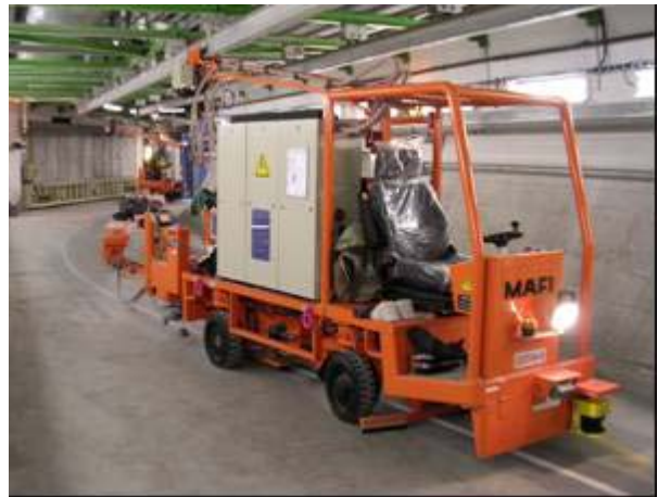
Figure 4: A cryo-dipole transport vehicle follows the guidance line in a bypass tunnel.

The acceptance testing at CERN helped to prepare the transport infrastructure for the final installation. Tools were developed to commission the 27 km long transport infrastructure sector by sector, in particular the overhead power rail, before the first test runs with the vehicles. Figure 4 shows the unloaded cryo-dipole tunnel vehicle following the guidance line in the bypass galleries around one of the LHC experiments.