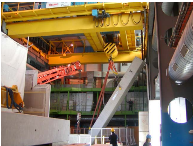
Figure 3: Tilting manoeuvre into PX85 shaft by means of coordinating building overhead crane and mobile crane.

A recent and very spectacular example was the installation of 5 shielding beams (14.4-m long, 800-mm wide, 1000-mm high and 28.8-t weight) in the LHCb cavern. Figure 3 shows a photo of the handling sequence.