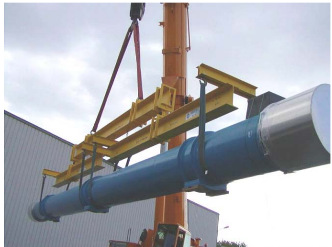
Figure 1: LHC cryodipole during handling with mobile crane. A double rotating spreader is used to guarantee the correct repartition of the loads as required.

The LHC cryomagnets are a typical example of very complex components with very special transport requirements. The arc cryodipole that is 16-m long and weighs 34 t is the biggest of the about 2000 cryomagnets: 1232 out of those units will be installed all around the LHC tunnel.