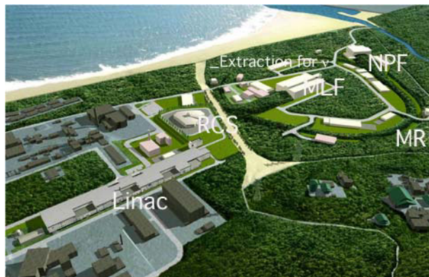
Figure 1: The expected bird view of the J-PARC.

Last year some changes were made for the J-PARC project. The detail and the influence on the beam performance is presented in the next section. The construction status of the J-PARC accelerator is reported together with some development results and the linac beam commissioning in the following sections.