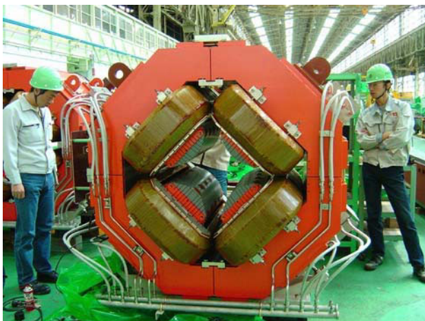
Figure 4: The RCS Q magnet first produced

Recently the first RCS quadrupole magnet was completed as shown in Fig. 4. Special devices, such as stranded coils, Rogowsky-like cuts, and the slits at the core ends are incorporated in order to reduce the eddy-current effects on the magnets.[8]