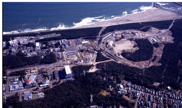
Figure 2: The present photograph of the J-PARC.