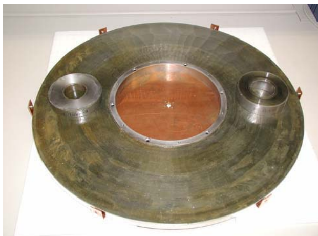
Fig. 1: One full size nanocrystalline Finemet FT-3L ring core from Hitachi with a measured \mu_r Q_C f_0 value of 5.3 GHz. On both sides the ring core is covered by a thin resin layer. On the left side one can see a 1:5 sample of a Finemet core, on the right side a 1:5 sample of an amorphous VitroVAC 6030F sample from Vacuumschmelze

flows from the inside to the outside of the core along a single ribbon. This current is very small since the path has a huge inductance, given that a laminated core contains thousands of turns.