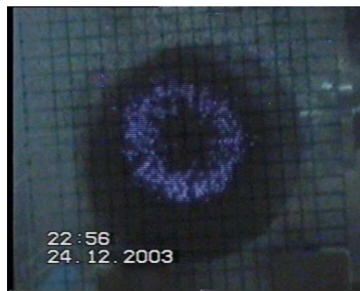
Figure 2: Cross-section image of the wavebeam behind the test cavity.

An image of the wavebeam cross-section obtained behind the test cavity using the monitor of wavebeam position and size [FEL03f] is illustrated in Fig. 2. The intensity profile looks as well-expressed TE_{01} -like distribution.