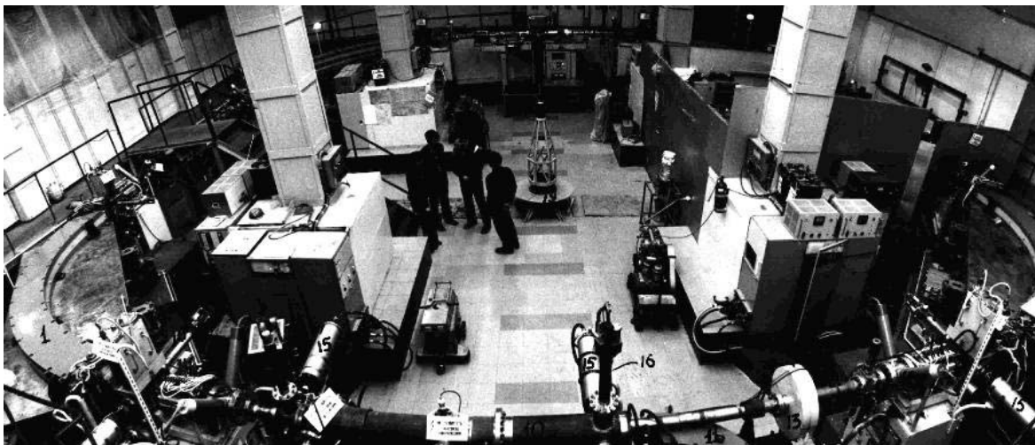
Fig.1. "Santa sanctorum" of electron cooling – the NAP-M storage ring.

In 1972 the designing of NAP-M - "Antiproton Storage Ring – Model" (Russian) was begun (Fig.1). Soon it became "Sancta sanctorum" of electron cooling when in 1974 first electron cooling of protons was performed in this ring [4].