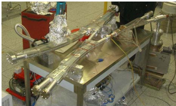
Figure 2: Dipole vacuum chambers under test.

Using a large aperture quadrupole magnet this straight vacuum chamber doubles its inner transverse dimensions on the horizontal and vertical plane at the central point, by means of two long tapers, and allow a wide variation of the beam size.