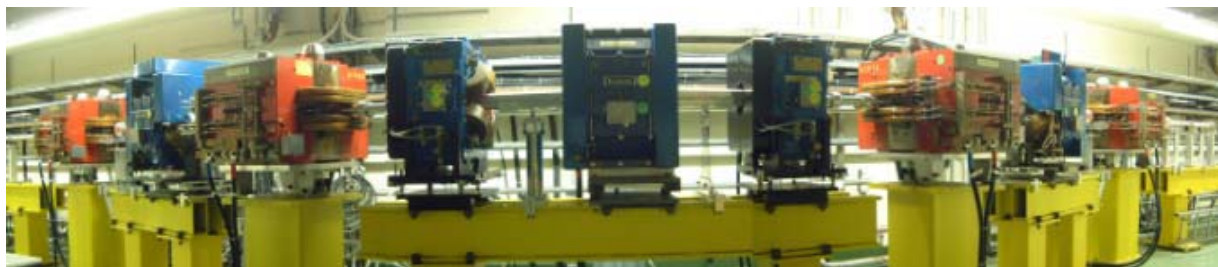
Figure 3: Installed chicane fish-eye picture

Looking at a second OTR screen placed after the spectrometer dipole, the longitudinal phase space can be reconstructed. The expected resolution will be better than 0.5 ps. This system is described in a dedicated paper in these proceedings [9].