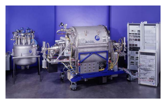
Figure 2: Superconducting accelerator module for the Taiwan Light Source with valve box (left) and SRF electronics (right) prior shipment to NSRRC.

The assembly hall of the SRF modules at our premises can be seen in figure 3. Up to three SRF modules can be assembled in parallel.