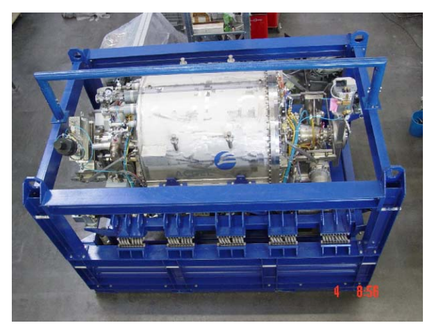
Figure 4: Completed SRF module for Cornell University installed into shipping frame.