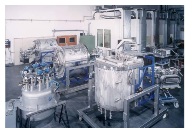
Figure 3: Assembly area of the SRF modules at ACCEL. In the upper right part the clean room class 100 can be seen where the modules need to be assembled in whenever the cavity vacuum is touched.

For the careful shipping of the modules a special shipping frame was constructed preventing the module form shock during transportation. Figure 4 shows one module for Cornell University assembled to the shipping frame.