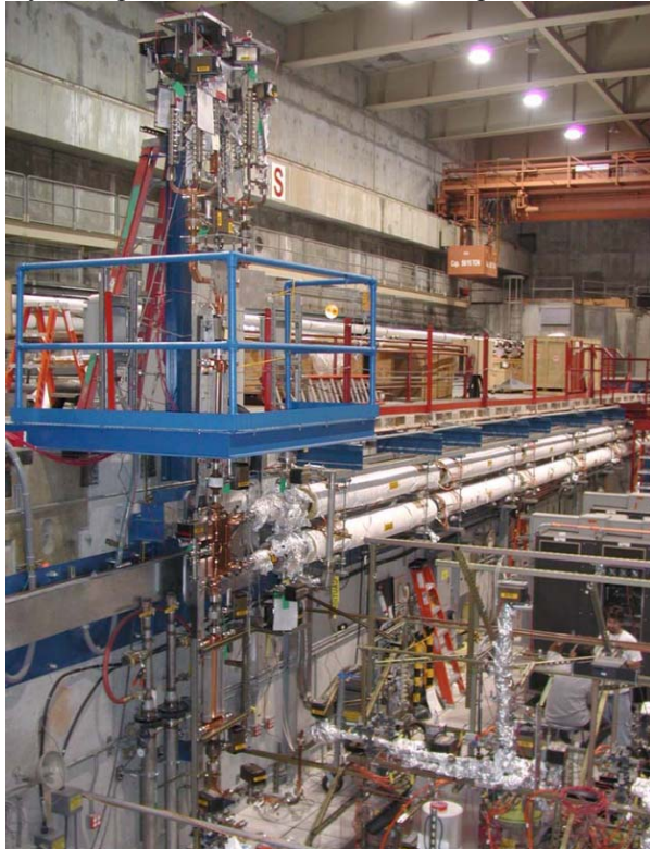
Figure 2: The 8-Pack system, showing the SLED delay lines (white) attached to the copper over-height SLED head, and the high power loads above. The klystrons are in the lower right.

The klystron power is combined in pairs in single-moded WR90 wave guide and transported to the SLED-II pulse compression system. Here the power from the two klystron pairs is combined and manipulated in over-