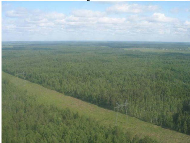
Figure 2. The view of ILC proposed area from helicopter.

the form of single hills and ridges have smoothed shapes, soft outlines and small excesses. The territory of the area is waterlogged. The absolute marks of the surface range from 125 to 135 m with regard to the Baltic Sea level.