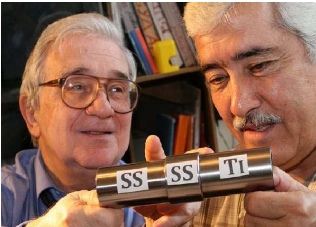
Figure 4. Explosion welding of bimetal tubes.

Specialists from JINR and VNIIEF (Sarov) have studied the possibility to produce a tube of bimetal type (stainless steel and titanium) by explosion welding (Fig.4). The tube is used as a transitional load-bearing element in the 4th generation cryomodule construction for the ILC.