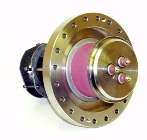
Figure . 2: Picture of ion source prototype (rear view)

To verify the possibility of RIS production the prototype (Fig.1,2) with graphite as the working agent was developed and tested. During the experiments on a prototype the reliability of the selected design was confirmed, the evaluation of power consumption required to maintain a given temperature inside the prototype was done as well as the study of vacuum conditions required.