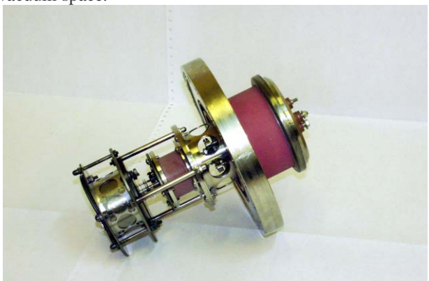
Figure. 1: Picture of ion source prototype (side view) The produced vapor which contains radioactive ions gets thermally ionized on the internal walls of a container. The flux of a mix of atoms and ions of radioactive elements is directed to the accelerating space via the

The radioactive ion source (RIS) which is under development for SPES project [1] will consist of the container made of heat-resistant material (Ta, W), filled by disks made of <sup>235</sup>U compounds 1 mm in thickness. The container heated up to the temperature 2500<sup>0</sup> C is irradiated by the neutron flux 10<sup>10</sup> sec<sup>-1</sup>·cm<sup>-2</sup>. When neutrons interact with <sup>235</sup>U, the radioactive ions of various masses are produced. Ions being diffused towards the disk surface are evaporated into the container's free vacuum space.