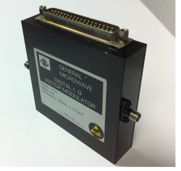
Figure 1: Digital I-Q vector modulator.

control system computer need to follow each set point