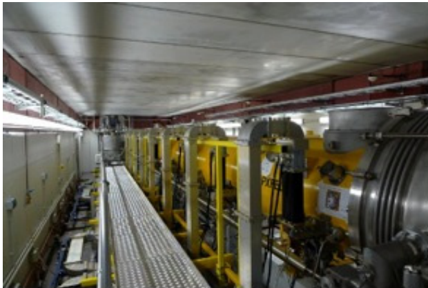
Figure 2: The first European XFEL prototype cryomodule developed in cooperation of DESY/INFN, IHEP and Chinese industry, and installed in DESY/FLASH.

Recently, IHEP contributed to the European XFEL in a prototype cryomodule development in cooperation with Chinese industry under supervision of INFN/DESY. The first prototype cryomodule has been recently installed into the FLASH tunnel at DESY, as shown in Fig. 2 [8].