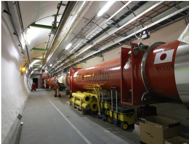
Figure 1: Superconducting quadrupole magnet system installed in the LHC beam interaction region in cooperation of CERN, FNAL, KEK, and Japanese industry.

Recently, IHEP contributed to the European XFEL in a prototype cryomodule development in cooperation with Chinese industry under supervision of INFN/DESY. The first prototype cryomodule has been recently installed into the FLASH tunnel at DESY, as shown in Fig. 2 [8].