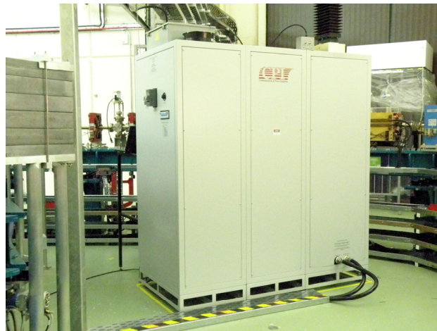
Figure 1: VIL409 high power RF amplifier installed at the Daresbury Laboratory

could be optimized for use in the EMMA accelerator. Therefore, the user has the ability to remotely set IOT Beam voltage within the range from -38 to -45 kV (with respect to Earth/ground) and the IOT grid bias voltage within the range from -85 to -130 V (with respect to the IOT's cathode potential). In addition to a straight forward DC grid bias voltage set, the user may also elect to pulse the grid.