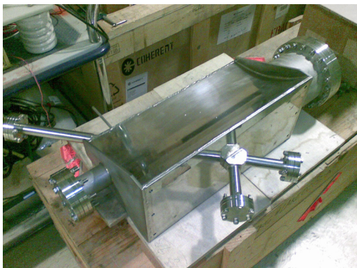
Figure 3: The vacuum chamber for alpha magnet; a collimator will be installed inside

The vacuum chamber for the alpha magnet has been built and tested (Figure 3). A motorized collimator has been built and will be installed in the vacuum chamber for beam selection before injecting into the linac for acceleration.