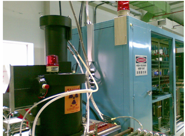
Figure 4: The 35 MW S-band pulsed klystron (with X-ray shielding) and modulator.

The 2998 MHz high power microwave system consists of a 35 MW, Thales TH2100A pulsed klystron which is powered by an 80 MW line-type high voltage pulser (Figure 4). Installation of this high voltage pulse has been completed recently and it is now under high voltage test. The klystron and focusing magnets has X-ray shields that meet radiation safety requirements when operating outside the concrete wall of the TLS booster room. A driver amplifier system with the one kilowatt Thales TH2047 klystron for the high power TH2100A pulsed klystron has been installed and tested successfully (Figure 4). This microwave system is synchronized with the photoinjector drive laser system (as described in the introduction of this paper). This synchronization is good for future experimental studies on laser-beam interactions (e.g. head-on ICS X-ray, see the following section).