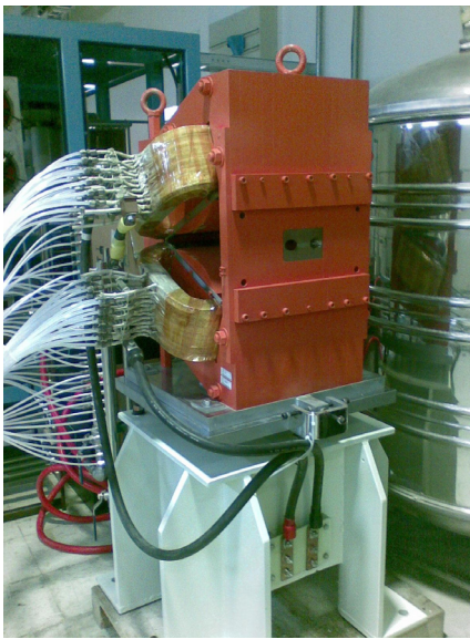
Figure 2: The alpha magnet fabricated in house for bunch length compression

An alpha magnet has been fabricated in house and tested preliminarily up to 450 gauss/cm with adequate cooling (Figure 2). Further characterization of field properties is required.