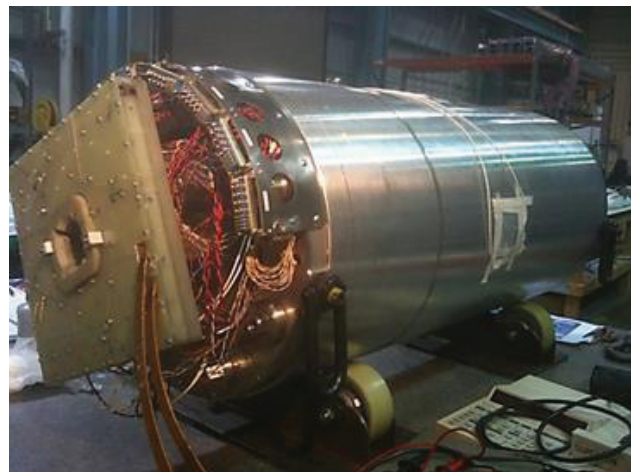
Figure 1: Assembled HQ02a quadrupole [9].

Following the selection of 150 mm aperture quadrupoles for the new IR layout, the development and demonstration of prototypes has started and will become the dominant part of the LARP effort during the next several years. The main goal for this phase is to fabricate and test a series of four meter long prototypes (LQXF). In addition, a series of short models of the same design (SQXF) will be fabricated and tested in collaboration between LARP and CERN.