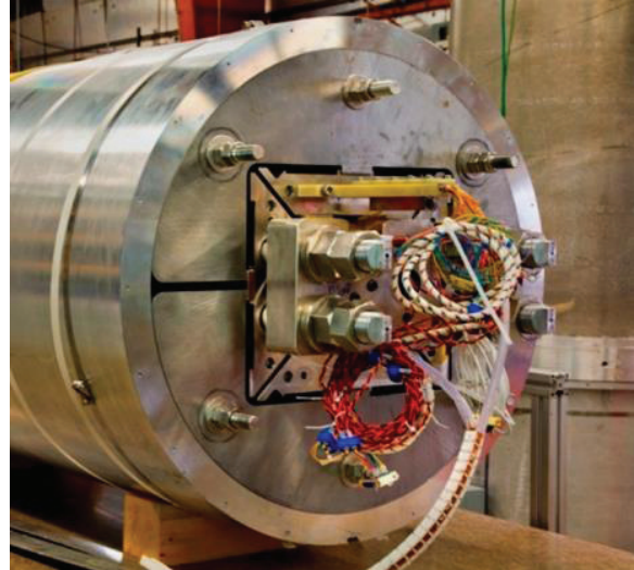
Figure 3: HD2 model [19].

The next step in this series, HD2 (Fig. 3) incorporates key design features relevant to accelerator applications [19]. The magnet achieved a maximum dipole field of 13.8 T at 4.5K, to be compared with a short sample dipole field of 15.6 T at 4.5 K. The short sample field at 1.9K is 17.1 T. these values can be considered as a practical limit for accelerator quality designs using state of the art Nb 3 Sn conductor.